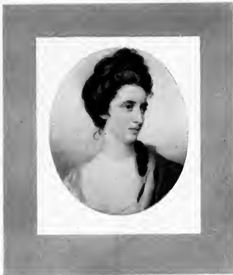
MARY, WIFE OF THE EIGHTH EARL OF THANET (OB. 1778) BY OZIAS HUMPHRY